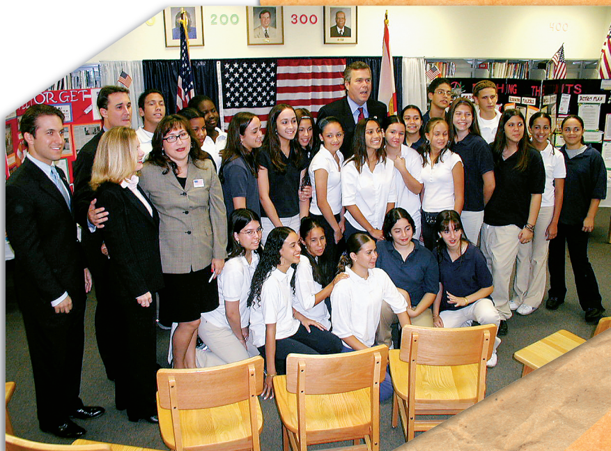
Students in a Project Citizen class in Hialeah, Florida, pose with Florida governor Jeb Bush.