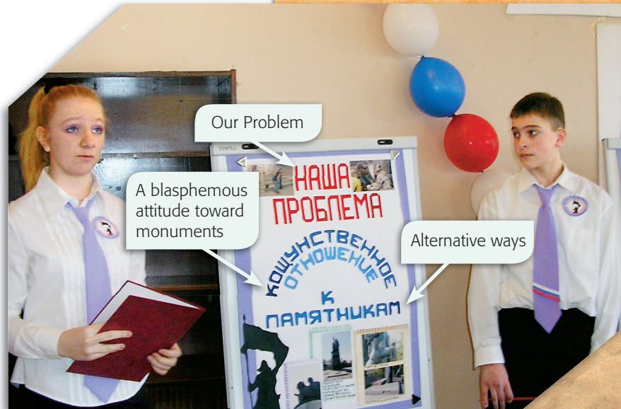
Students in Vladivostok took action to protect historic public monuments.

Taking Action The students started by contacting people who worked with the monuments and asking about the damage and the cost of repairs. Soon, museum leaders and officials from local agencies that supported sports like skateboarding agreed to work with the students. The students wrote letters to the mayor and members of the Duma (a Russian legislature) supporting a public skateboarding area. The teens then had a meeting with the mayor, who liked their idea but had no extra money in that year's city budget. The members of the Duma, however, promised to consider including funds for the project in the next year's budget. City officials soon started looking for a location for the park. By the end of the year, the city had a plan to begin building a public skateboarding park.